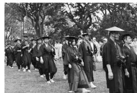
the parade in the Japanese festival in Central Park (セントラルパークの日本の祭りでのパレード)